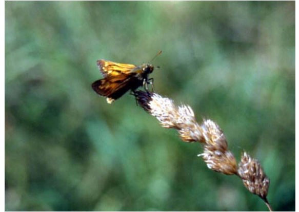
Figure 9: Large skipper observed during one of the butterfly surveys, Summer 2003.

The species seen in each section of the route are listed below. In each case it is also noted on which survey the sighting was made (5, 7 and 8 indicating May, July and August respectively).