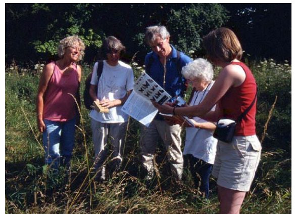
Figure 11: Butterfly survey in West Oxford, Summer 2003.